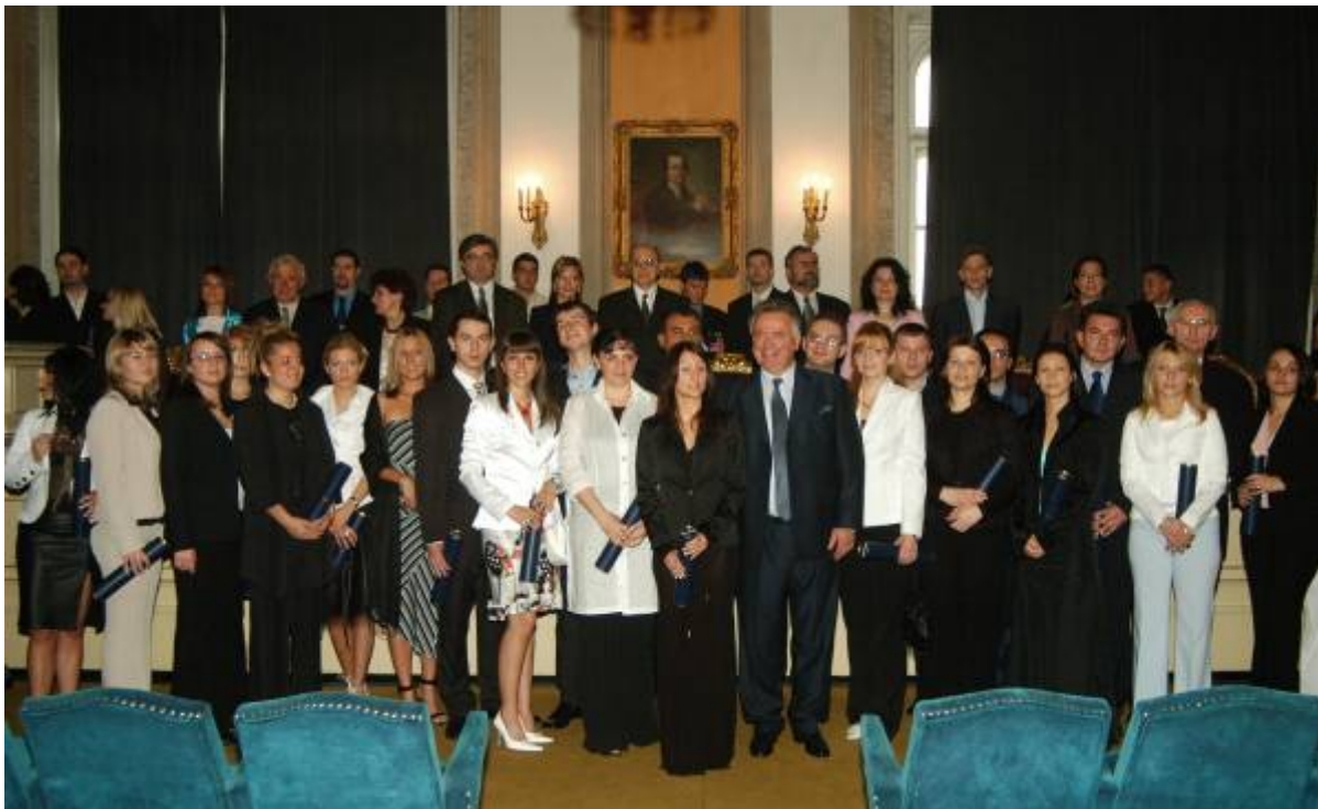
European University Rector with Graduates