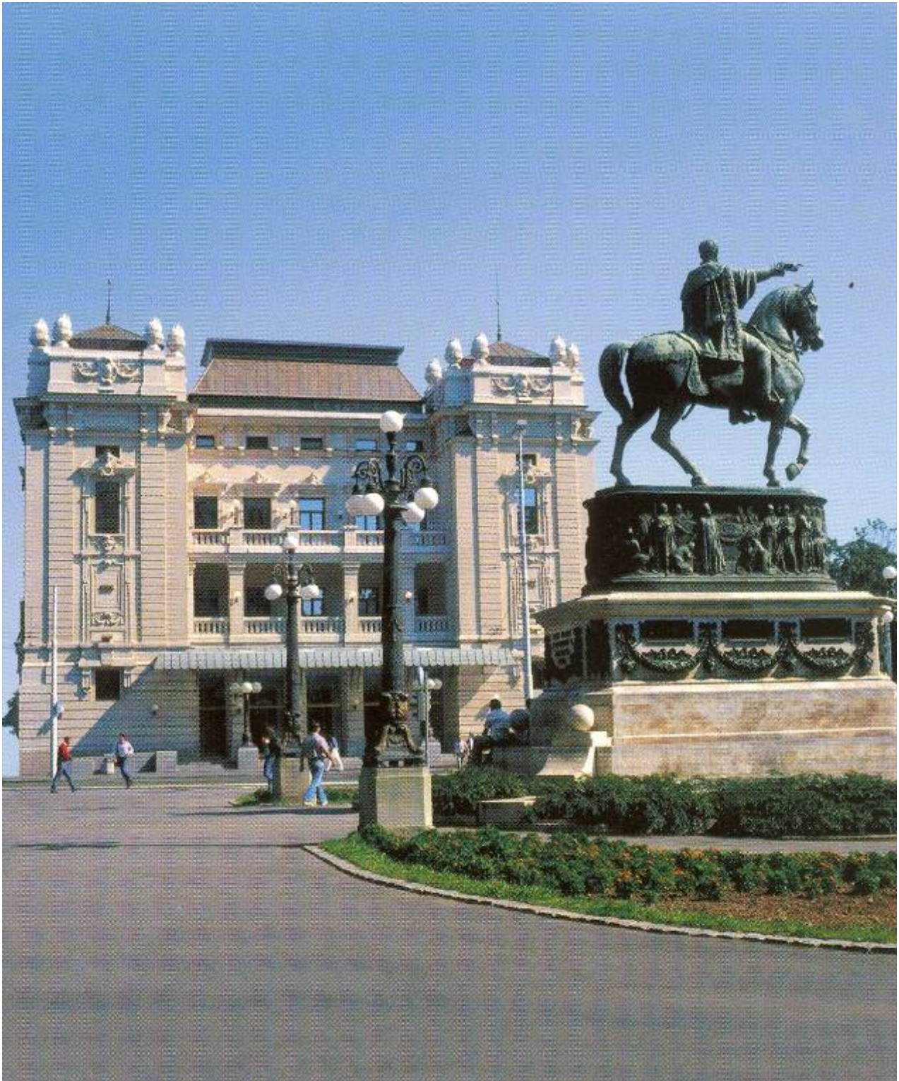
National Theater and Duke Mihailo Monument