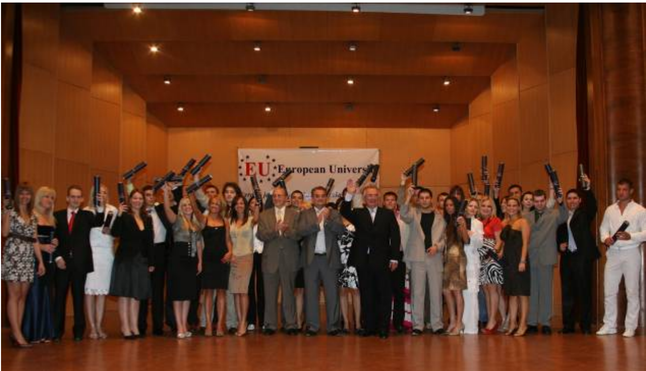
Graduates of Faculty of International Engineering Management

The aim of an internship is to enable students to apply previously gained theoretical and practical knowledge to solve concrete, practical manager problems within a chosen company or institution. Students will be introduced to the company or institution activities, the way of doing business, managing and managerial decision making process in organizational structures Students will acquire direct knowledge and experience in functioning and organizing of companies, banks, hotels, telecommunication system, air-line companies and institutions involved in the operations within the profession students are trained for.